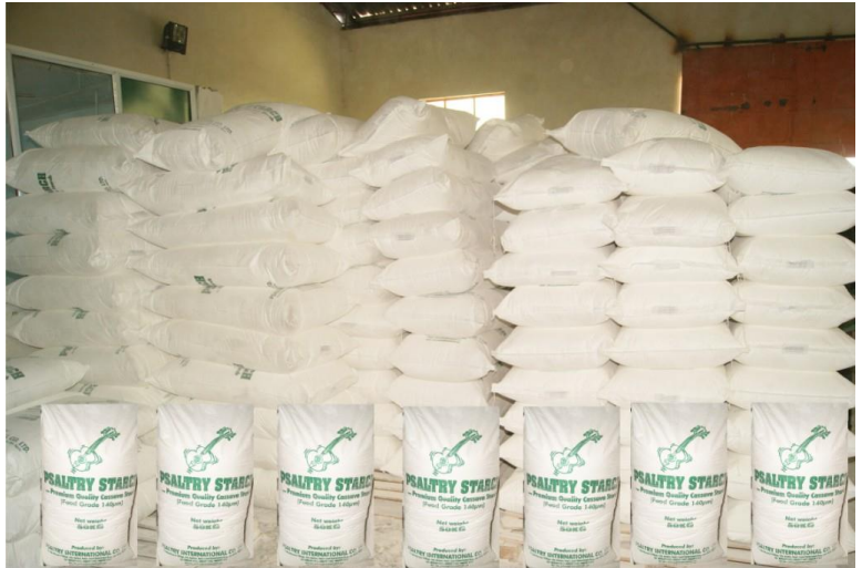
PIL will use the CACS loan to expand production

The CACS facility is supporting companies like Psaltry with loans at single-digit interest rates, to increase output, generate employment, diversify the revenue base, increase foreign exchange earnings and provide input for the industrial sector on a sustainable basis.